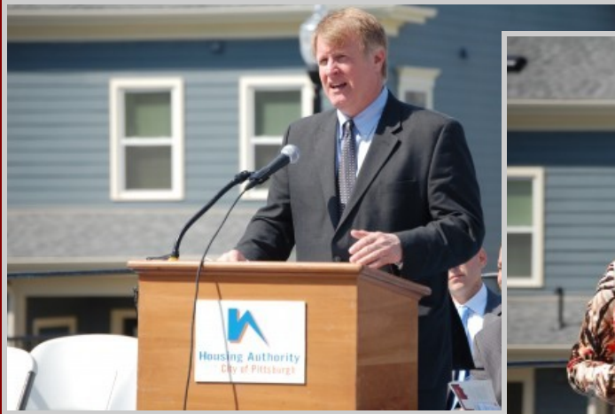
Allegheeny County Executive Rich Fitzgerald