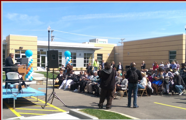
Over one hundred friends, residents, and partners attended ceremony